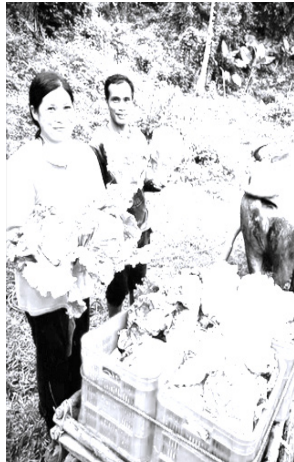
Farm Konek aims to create a sustainable clustered production of high-value and lowland vegetables through data-driven clustered and climate-proofed production among the smallholder farmers living below the poverty line.

More income for small farmers, MSMEs with DOST-supported marketing tech platforms